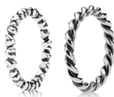
Combine with one or more matching styles