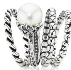
...to create your own combination of RINGS

Print out this page on A4 and place one of your rings against the circle. When the circle and the internal ring diameter match, you have found your correct ring size.