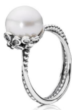
Choose your first RING